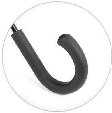
Piano black matt handle