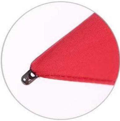
Elegant metal tips