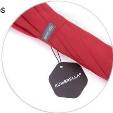
Nice RUMBRELLA strap