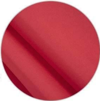
190T pure pongee fabric