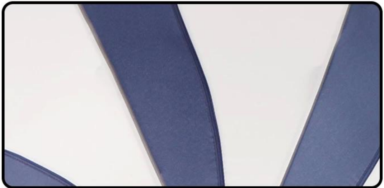
High density umbrella cloth, fine sewing, automatic wind resistant design.