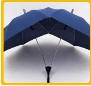
Double umbrella cover