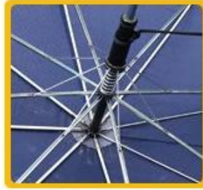
Firm umbrella frame