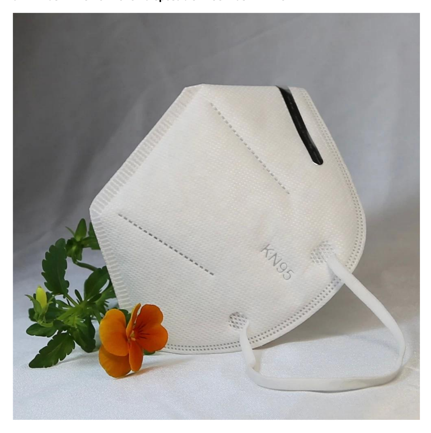
anti virus white nonwoven disposable kn95 mask with CE