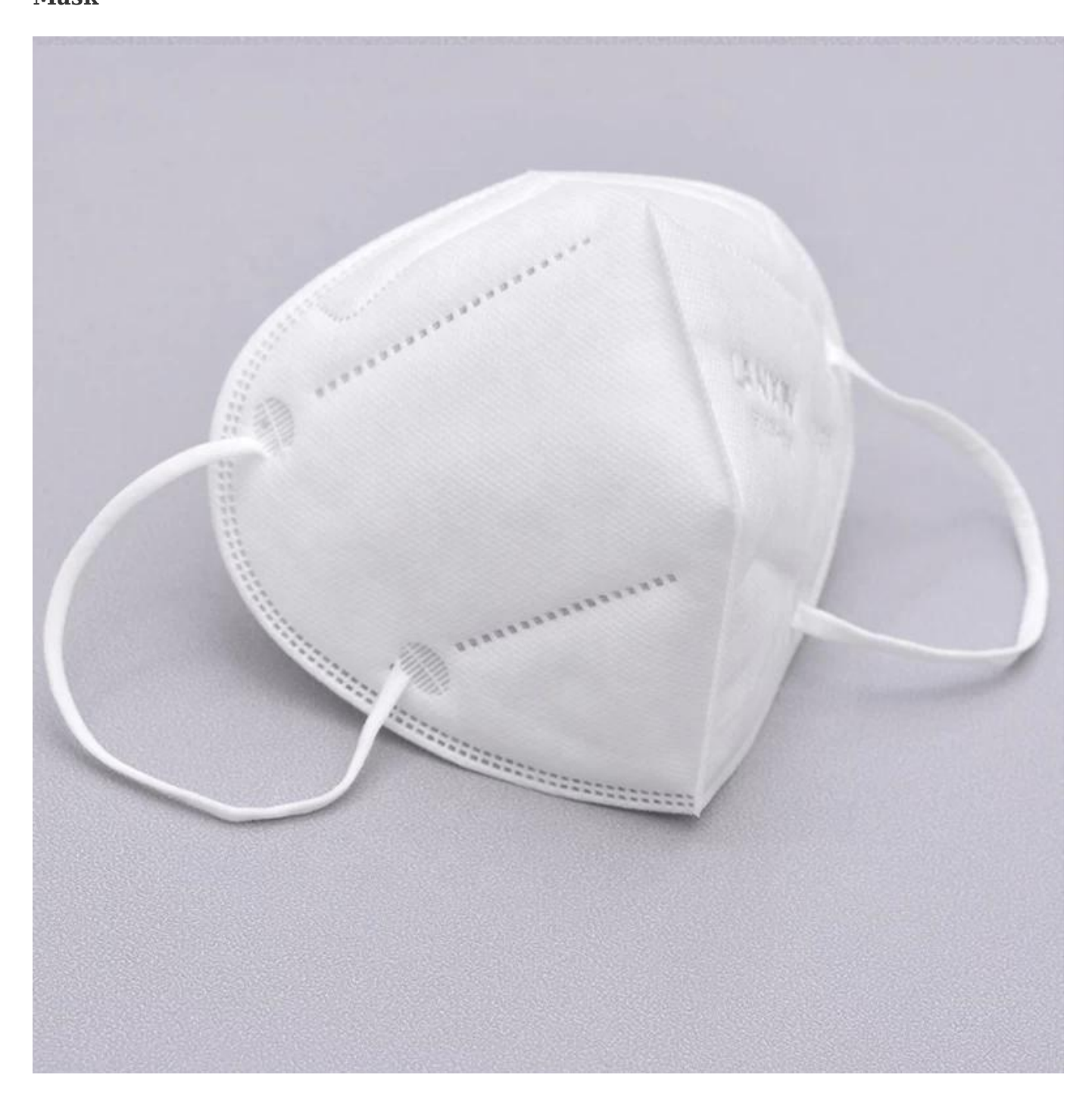
Wholesale N95 KN95 Anti Dust Safety Mouth Cover Disposable Respirator Face Mask