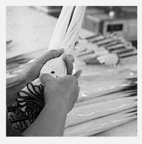
6. QUALITY CHECK