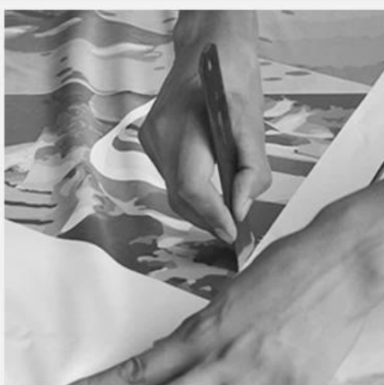
2. CUT FABRIC