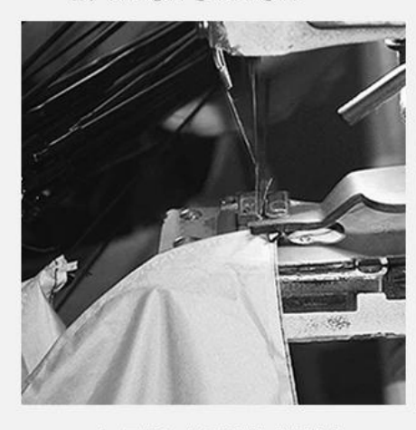
4. TIP ASSEMBLY