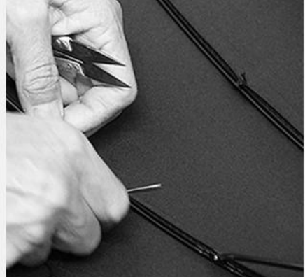
5. SEW UP