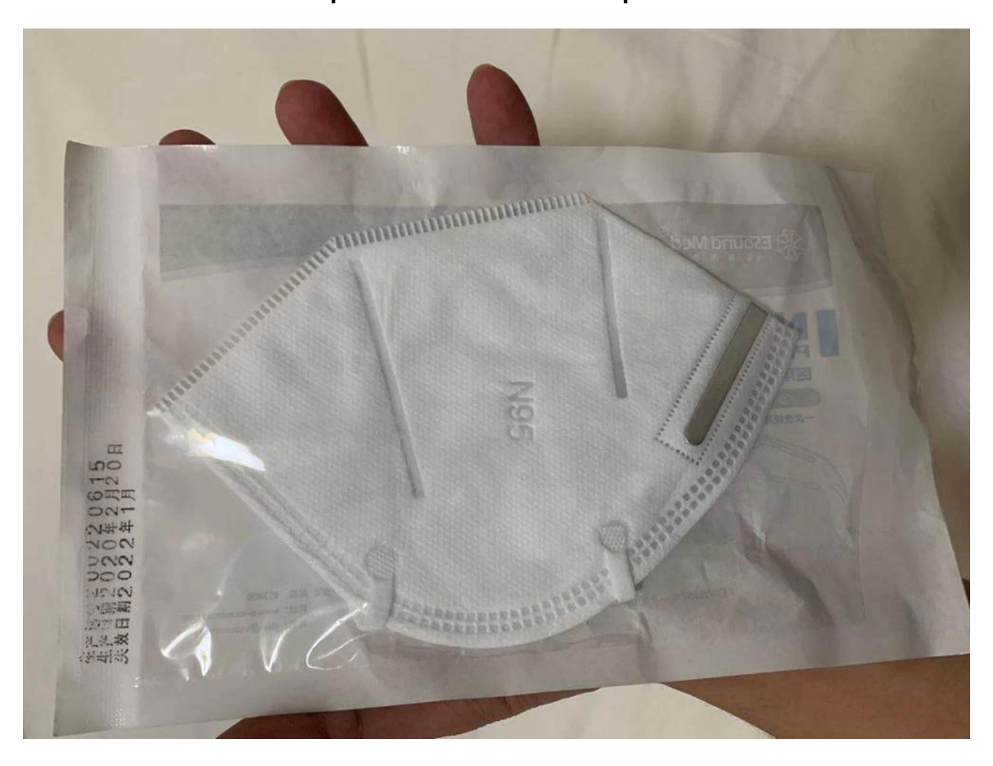
New Arrival Non-woven Disposable Face Mask Earloop KN95