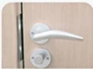
Door handle cleaning