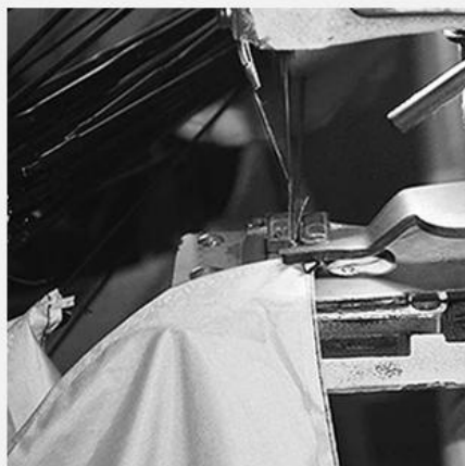
4. TIP ASSEMBLY