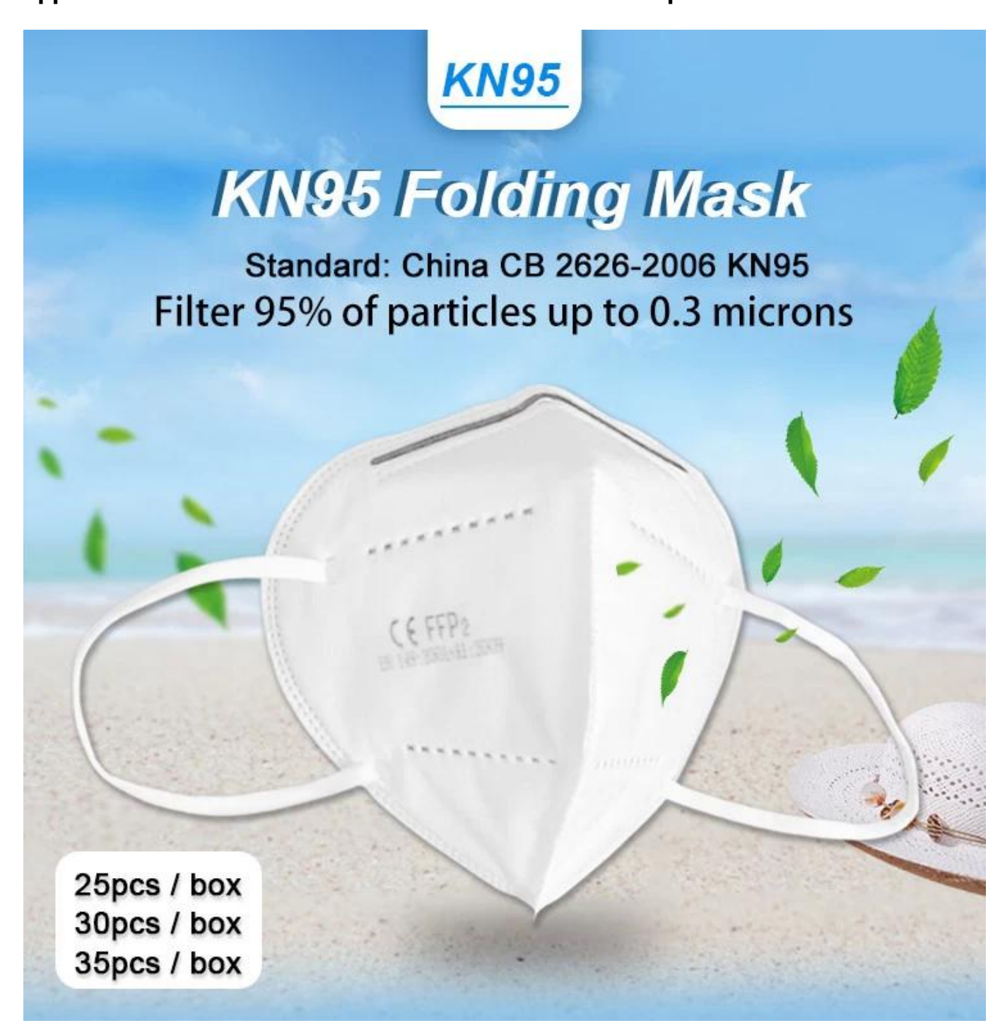
Fpp3 Ce Certified Ear 3D Anti virus Cover Face Mask Disposable Kn95