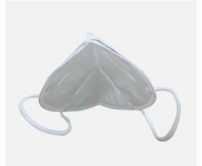
Effectively prevent exhaled exhaust gas