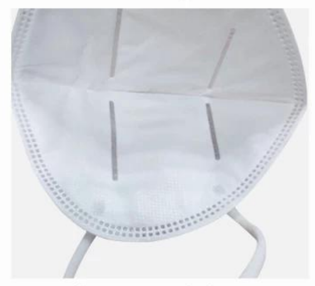
Effective control of germs