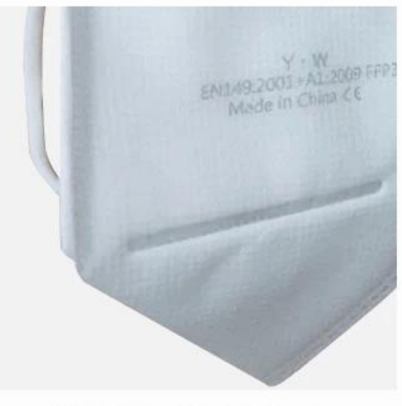
Waterproof non-woven fabric layer