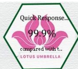
24 hours on line.

We focus on manufacture umbrella for 19 years, we can do it better, fast. Customized with low MOQ, Free sample, Free design, Shipping fast, Quick response