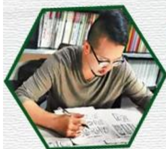
Free design service