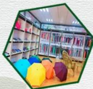
Umbrella sample room