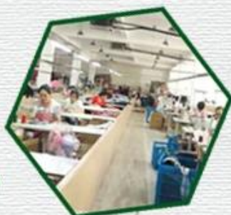
Factory production halls