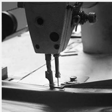
1. EDGE STITCH