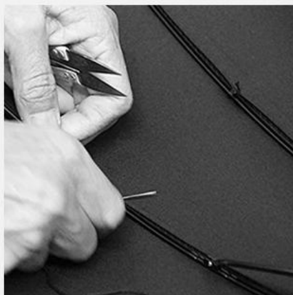
5. SEW UP