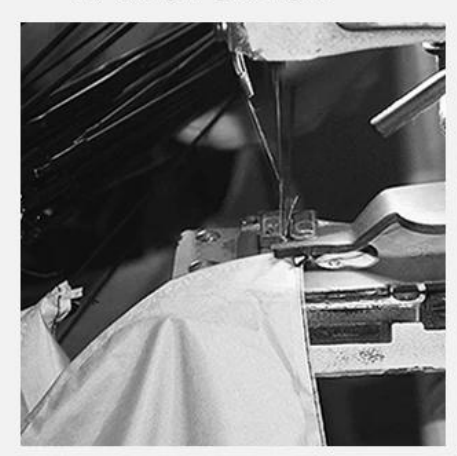
4. TIP ASSEMBLY