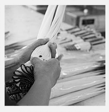
6. QUALITY CHECK