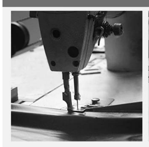
1. EDGE STITCH