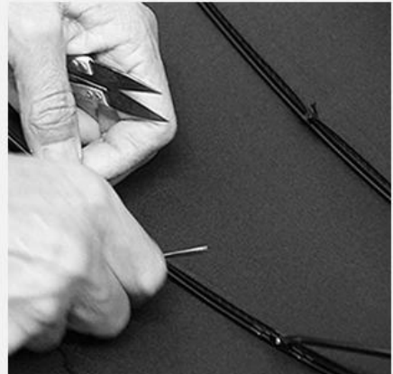
5. SEW UP