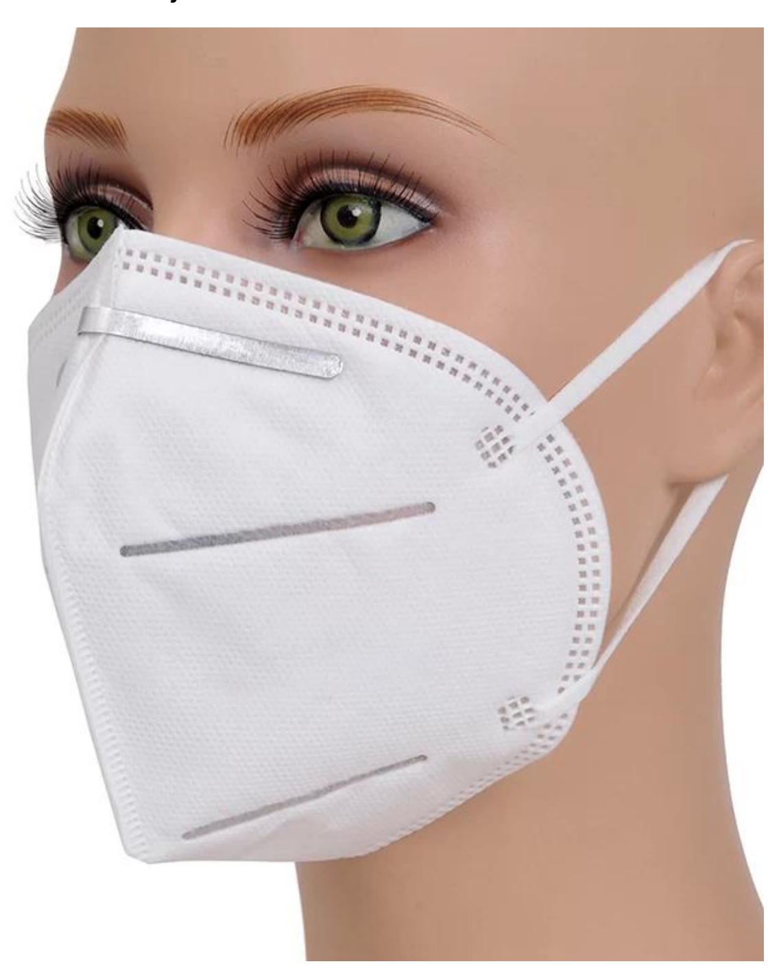
Anti virus white nonwoven recyclable kn95 face mask with CE certification