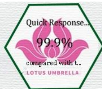
24 hours on line.

We focus on manufacture umbrella for 19 years, we can do it better, fast. Customized with low MOQ, Free sample, Free design, Shipping fast, Quick response