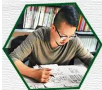
Free design service