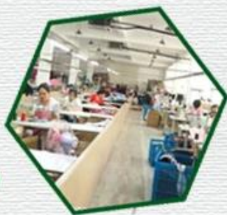
Factory production halls