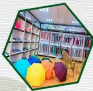
Umbrella sample room