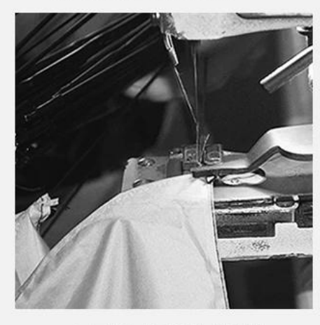
4. TIP ASSEMBLY