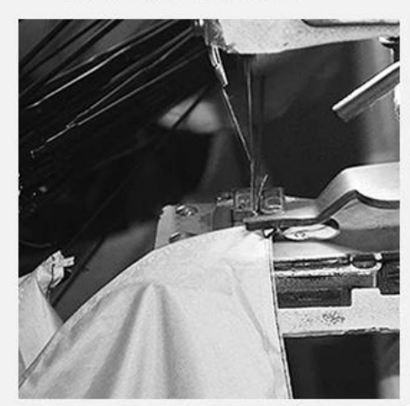
4. TIP ASSEMBLY