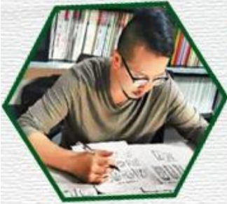
Free design service