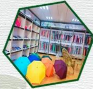
Umbrella sample room