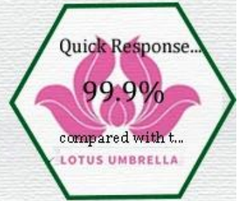
24 hours on line.

We focus on manufacture umbrella for 19 years, we can do it better, fast.