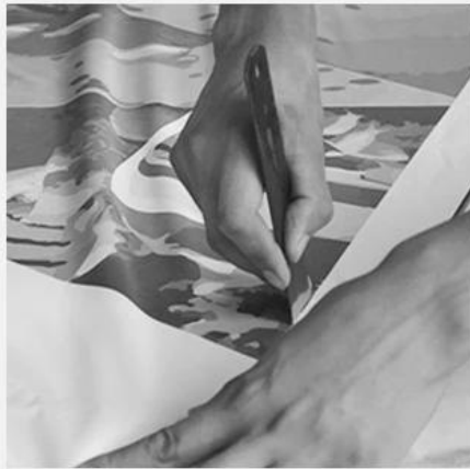
2. CUT FABRIC