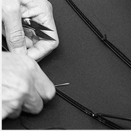
5. SEW UP