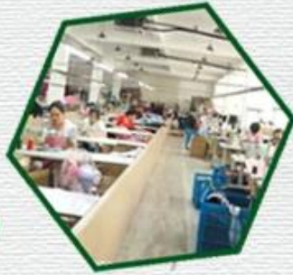
Factory production halls