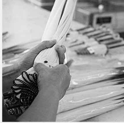
6. QUALITY CHECK