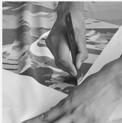
2. CUT FABRIC