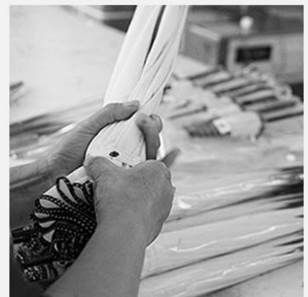
6. QUALITY CHECK