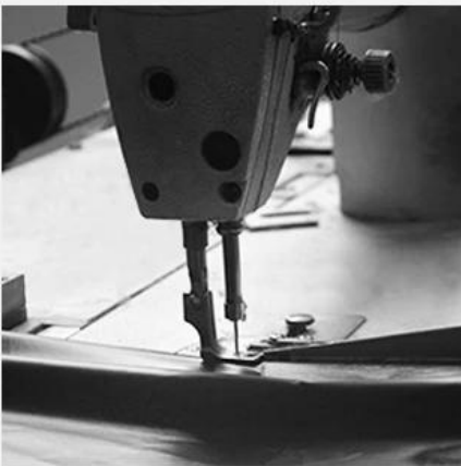
1. EDGE STITCH