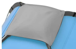
Removable Rain Fly