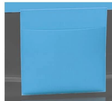
Interior Storage Pocket