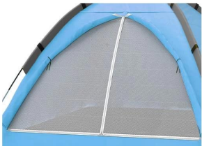
Mesh Ventilation Door