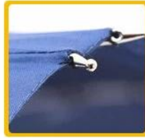
Anti falling umbrella head