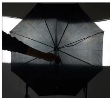
Other common umbrella