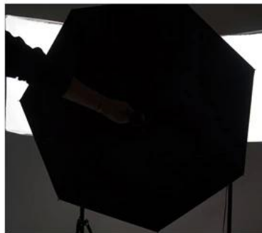
Lejorain UV umbrella