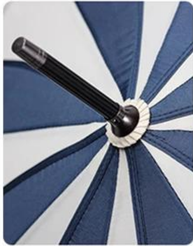
Strong umbrella hat