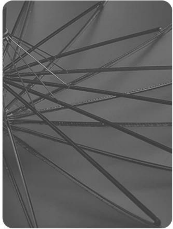
Ordinary steel umbrella stand