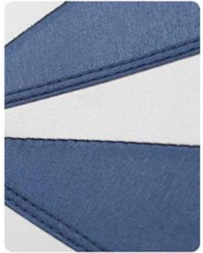
High quality umbrella cloth