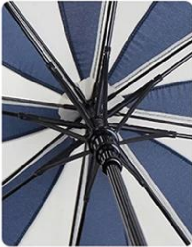
Tough umbrella stand