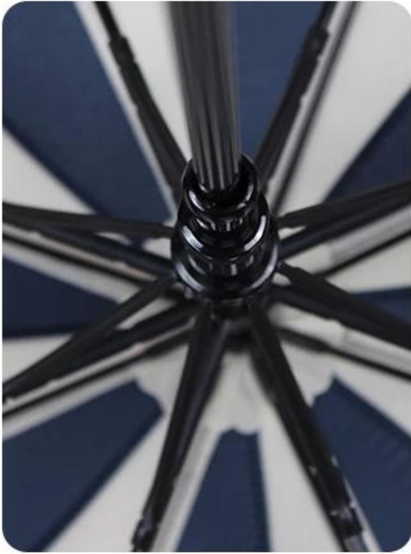
All-fiber umbrella stand