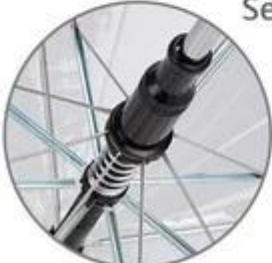
Sturdy umbrella bone