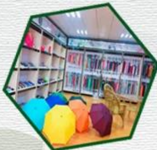
Umbrella sample room