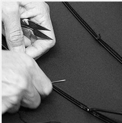
5. SEW UP