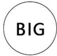
Enlarge the Diameter