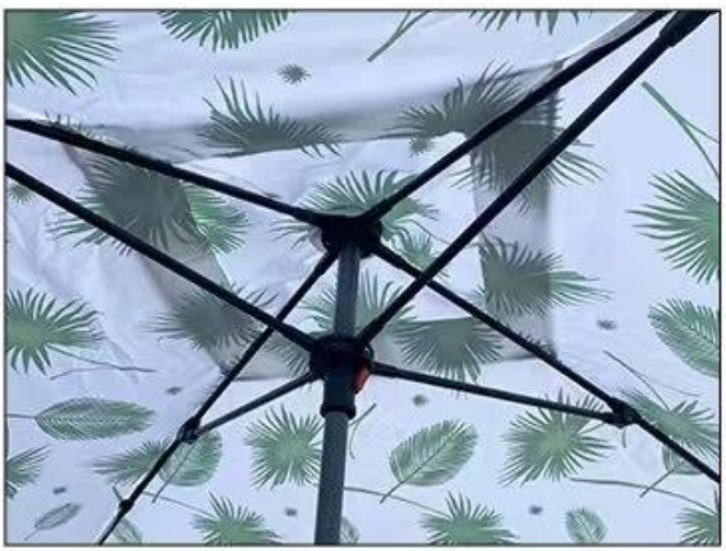
4 Ribs Provide Enhanced Durability