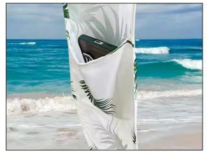
Small Storage Pocket