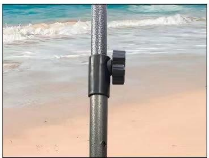
Adjust The Telescopic Knob